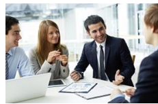
Financial Market Operations