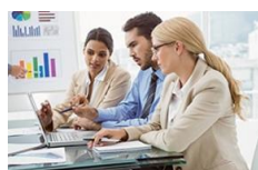
Financial Analysis and Portfolio Management