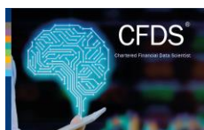
Financial Data Science